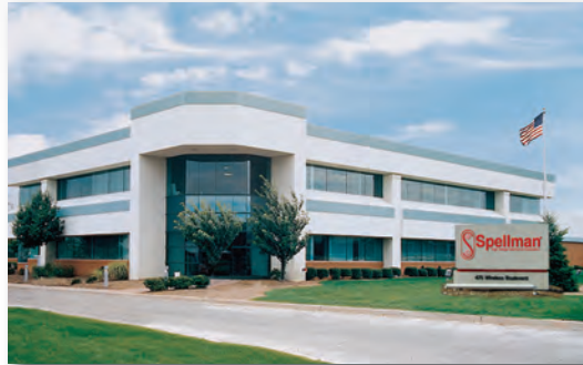
Spellman Corporate Office located in Hauppauge, New York, USA