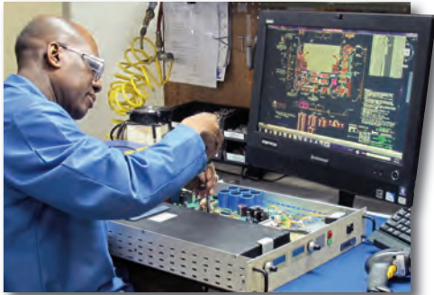
Repairs are made by qualified technicians using OEM parts

In our Preventative Maintenance (PM) Programs we replace “consumable” or “time-dependent” components, provide full factory test, calibration and burn-in, restoring the product to original factory specifications. On top of that, we add an inclusive warranty to protect your investment. PM is a great way to extend the life of your Spellman product, at a fraction of the cost of a new power supply or X-Ray source. Spellman certified upgrades can also be provided at a reduced cost.